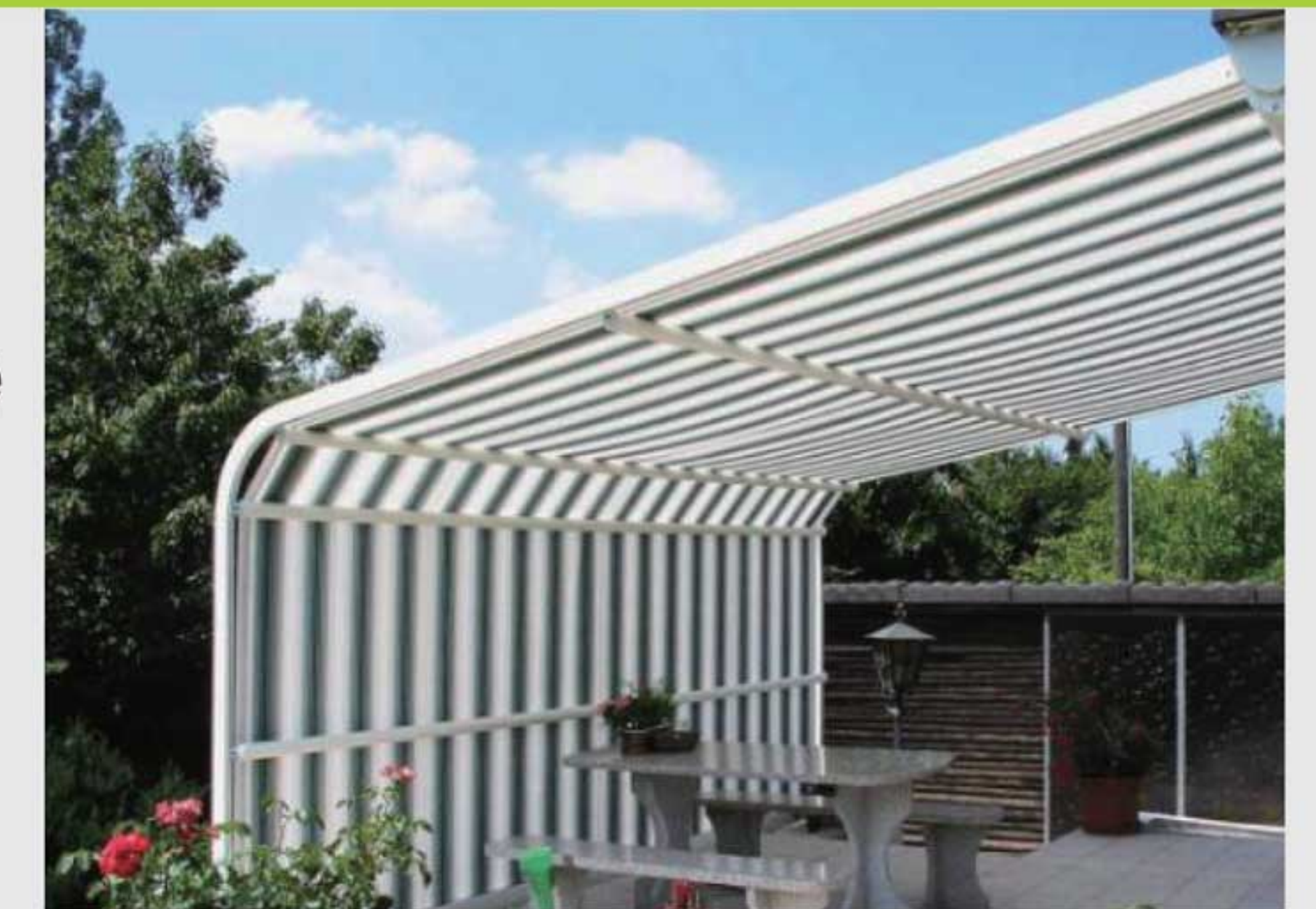
ARC type SK800