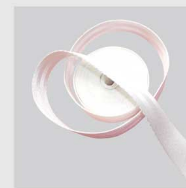
Tape 20 mm

1642 hours of weathering test, super-strength design, the outdoor life of more than 10 years.