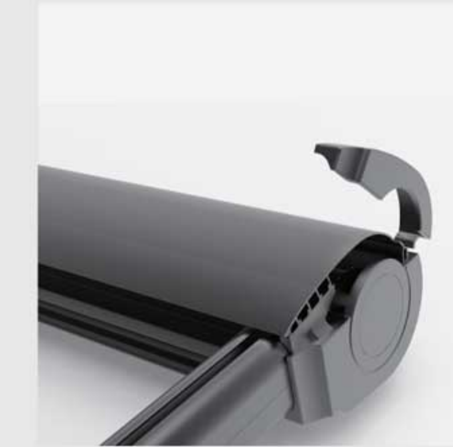
Quick release side cover easy to maintain