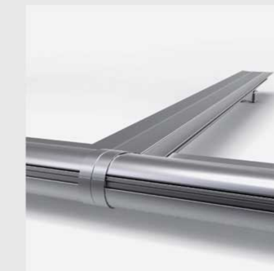
No gap between couple units when combined