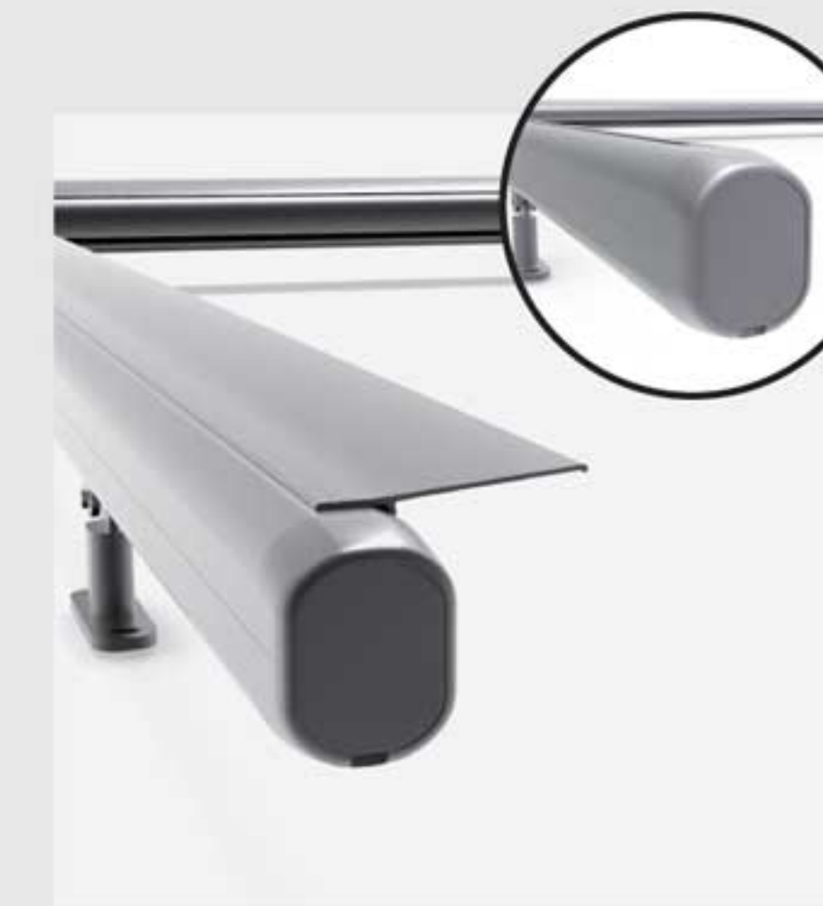
Unique guide rail Sun & rain cover as an option