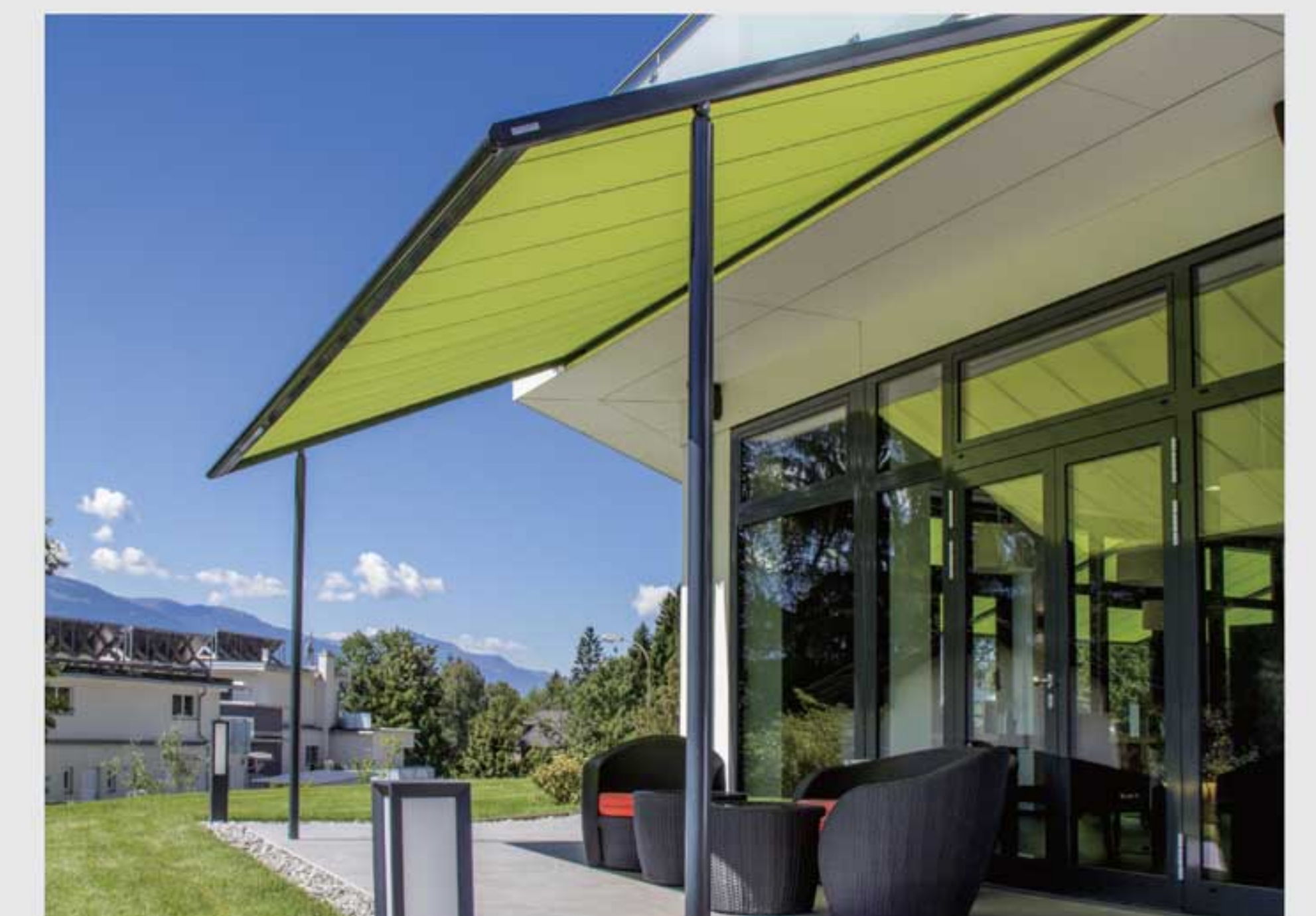
Rectangle type SK800