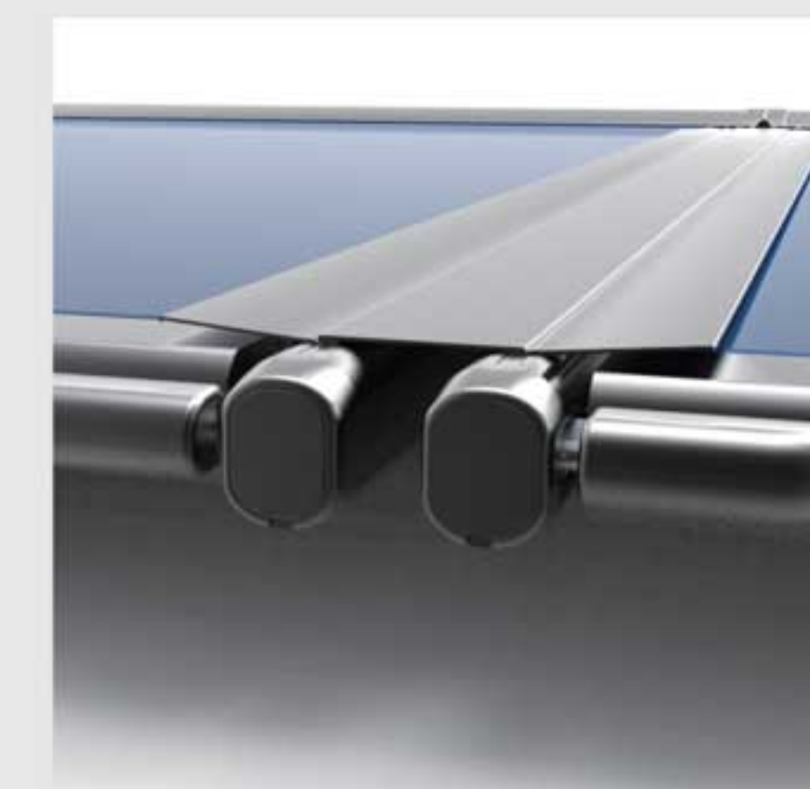
Special sun and rain cover Totally sealed by cover