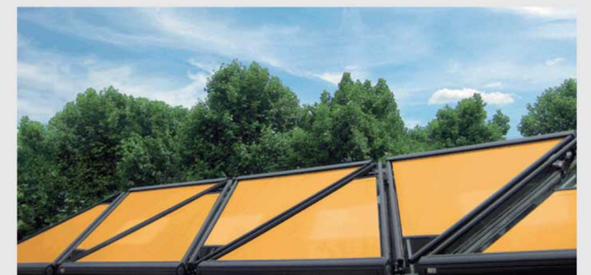
Triangle type SK800